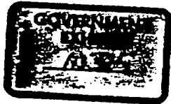
EXHIBIT 8/1/01 22 Hardwick

Microsoft Corporation is an equal opportunity employer.